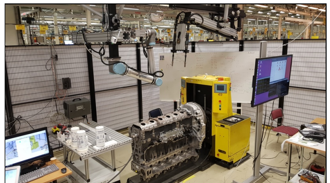
Fig. 1. Collaborative robot assembly station controlled by a network of ROS2 nodes.

interfaces, cameras, safety sensors, etc. Distributed large-scale automation systems require a communication architecture that enable reliable messaging, well-defined communication, good monitoring, and robust task planning and discrete control. In order to ease integration and development of different types of online algorithms for sensing, planning, and control of the hardware, various platforms have emerged as middle-ware solutions, one of which stands out is the Robot Operating System (ROS) [4].