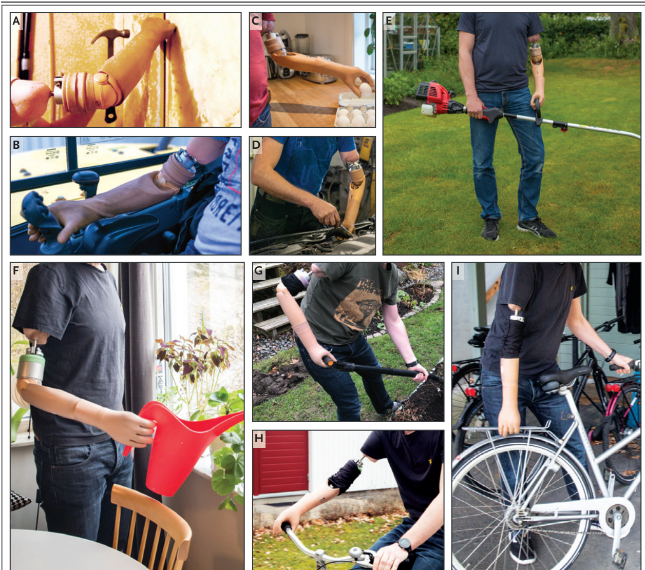
Figure 2. Neuromusculoskeletal Arm Prosthesis Used Unsupervised in Daily Life.

Shown are images of Patient 1 (Panels A and B), Patient 2 (Panels C, D, and E), and Patient 3 (Panels F, G, H, and I).