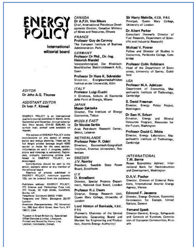
Fig. 1. Excerpt from the first issue and volume of Energy Policy (1973) (Editorial and International Editorial Board).