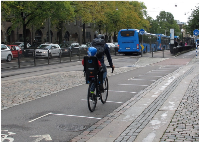
Fig. 2 One of the tested visual nudges, a series of perpendicular lines with decreasing distance to give the illusion of speed.

The haptic nudges were as previously described tested in a more experimental setting and with fewer participants. The tested nudges consisted of materials with different structure and softness, as well as bumps and slopes of different designs. The tested haptic nudges were being considered much less developed and potentially unsafe to try out on real bike lanes with unknowing bicyclists (Figure 3). Consequently, the tests were performed at an old abandoned ferry terminal, using the lanes that used to lead to the ferries.