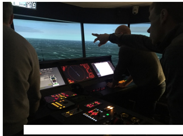
Figure 1. Full Mission Bridge Simulator