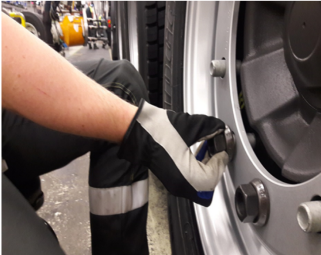
Fig. 2. Manual Mounting of Nuts.

hand tool, in this case, a pneumatic screwdriver. The operation used in the experiment is the totally manual assembly of the nut. The task is done as the initial nut mounting to ensure correct threads are used and for quality assurance as the power screwdriver tightens nuts with force irrespective of the location of the tread, illustrated in fig. 2.