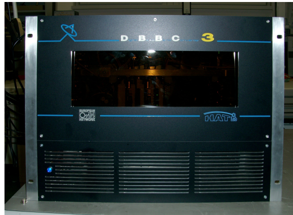
Fig. 1 Front view of the DBBC3.

The second element in the processing chain for each 4 GHz piece of band is the ADB3L sampler board. This sampler is the third generation of samplers in the DBBC family and is capable of sampling a band of 4,096 MHz making use of four separate sampler devices accommodated in the same board adjacent to each other. A number of calibration procedures have been implemented in hardware, firmware, and software presenting at the end for the user very simple commands to keep under control elements such as the offset, gain, and delay of the four samplers avoiding artifacts and optimizing the behavior of the sampling process. Several original methods were developed in order to achieve this goal.