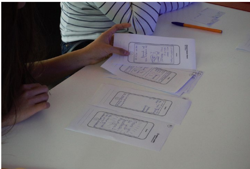
Figure 2. Prototype testing in concept evaluation workshop.