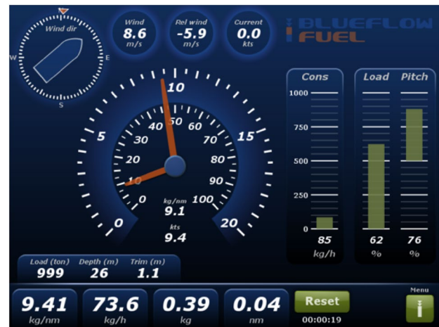
Fig. 2 Interface of the onboard monitoring energy system

and disappointment of the managers, they soon discovered that the ships did not reduce their consumption as expected.