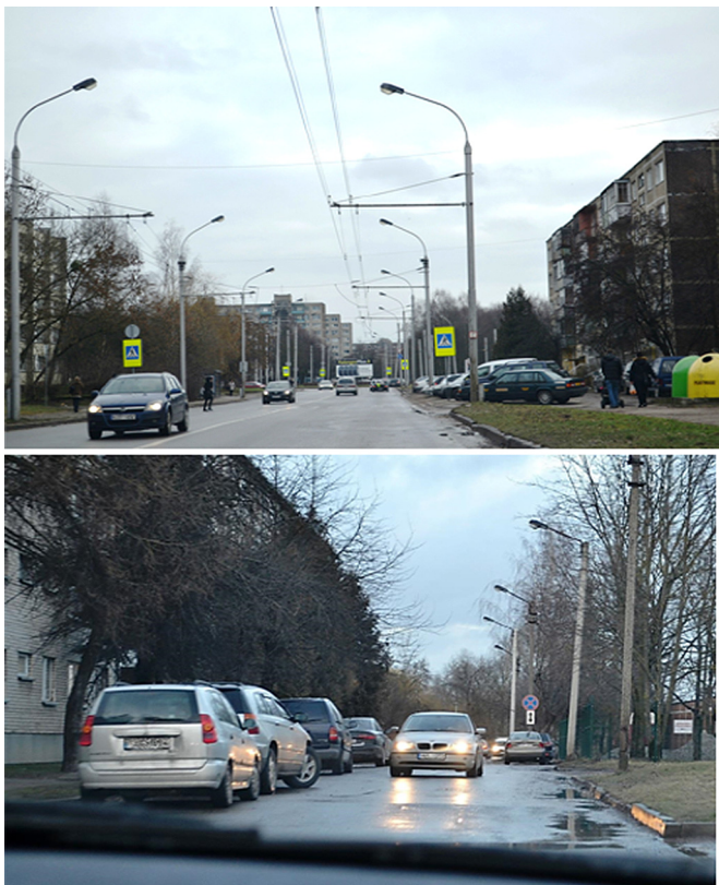
Fig. 1. Examples of the photos with potential traffic hazards.