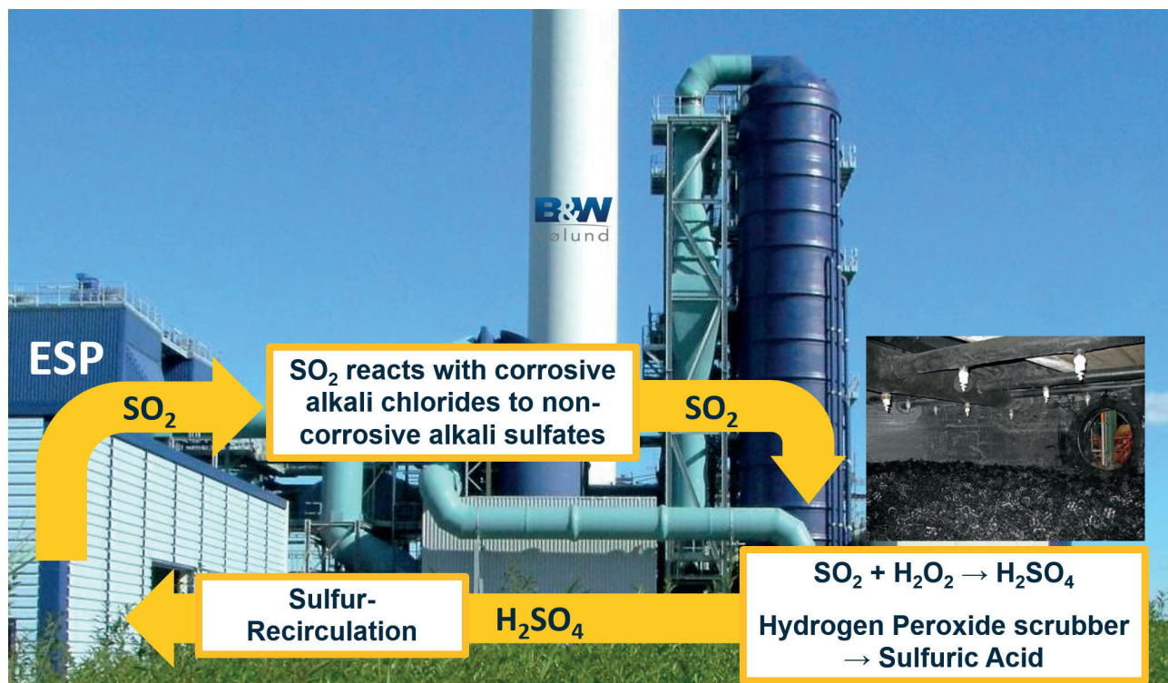
FIGURE 1: The flue gas treatment of MEC consists of an ESP (Electrostatic Precipitator), a HCl scrubber and a multistage scrubber for SO 2 removal, dioxin removal using ADIOX and flue gas condensation.

In 2016, Sulfur Recirculation was installed at Line 1 (L1) shown in Figure 1. The Sulfur Recirculation installation consists mainly of a storage vessel and dosage system