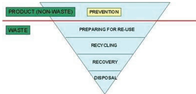
Figure 3: Classification methods for waste processing

With the development of new analytical procedures the detection limit is decreasing and in a more circular economy “everything can be found everywhere” this is a big communication challenge. “Same content” as a virgin material is not the same as “same functionality”. Small amounts of unwanted elements and compounds do not always indicate problems with the functionality. The recent years the legislation has been changed making it possible to use tests related to bioavailability that could replace chemical analysis. In cooperation with Orebro University a gene response based bio test has been developed and is now ready for standardization. The main benefit compared with other methods is that it is possible to evaluate if a negative impact on a specific organism is due to low/high concentration of harmless compounds like table salt or due to harmful compounds like heavy metals or e.g. Persistent Organic Pollutants (POP). One example of a product that contains a high concentration of a heavy metal but has low availability is a classical crystal glass. It contains about 15 w% lead (Pb) but there is no risk for lead poisoning even if it is used for drinking an acidic wine, the lead is not available for leaching.