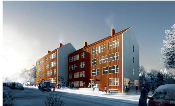
Figures 5 & 6. Presentation of building volumes.

residential rooms. The average rent for the dwellings is 1,599 SEK per sq m/year. These apartments provide 28 sq. per tenants as living area (private room and common space). The rent in this case is 3,728 SEK per month. The jury's evaluation of this solution of the task is stated as follows: