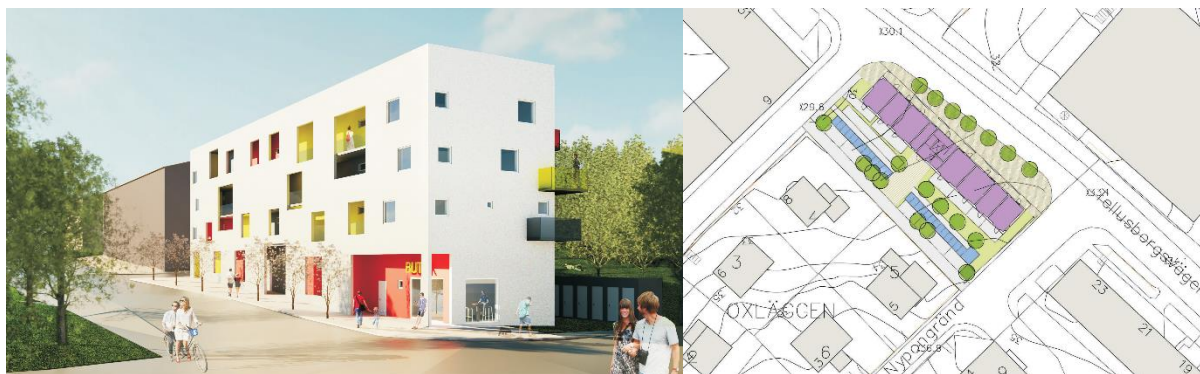
Figures 9 & 10. Proposal by Botrygg and Sonark Arkitektkontor. Perspective and site plan. 30 apartments at 1, 490 SEK per sq. m/year. Source: Botrygg and Sonark Arkitektkontor.

The team formation in the Stockholm competition was based on experiences of previous cooperation in