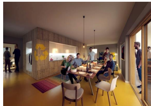
Figures 7 & 8. Floor plan and interior rendering. Source: Järntorget and Utopia Arkitekter.