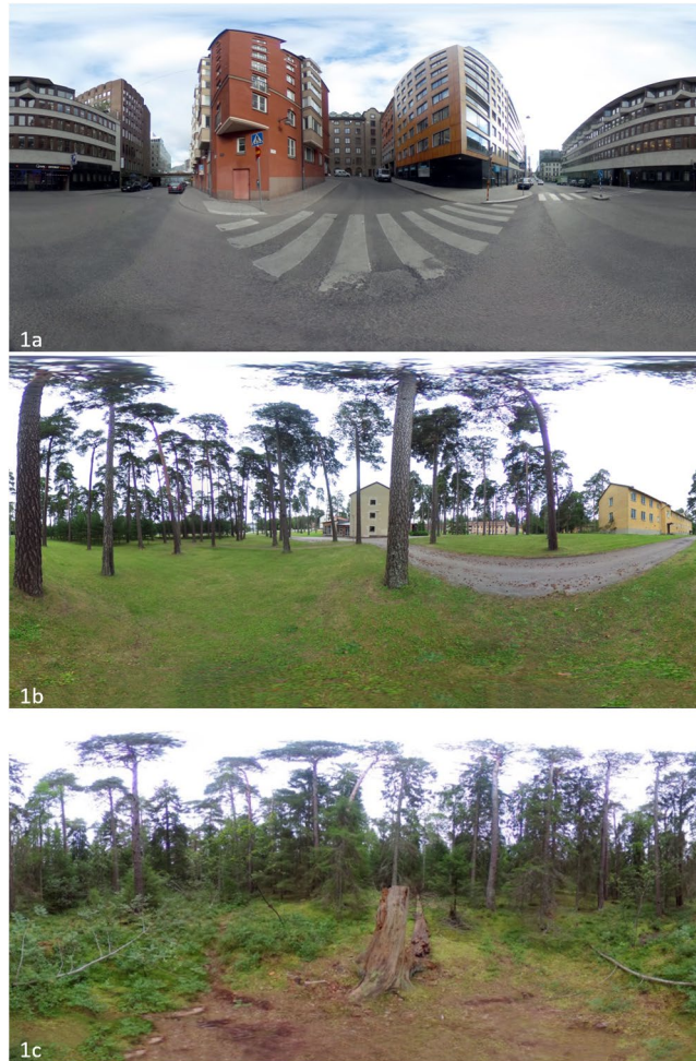
Figure 1. (a–c) Photos of the three environments, all located in Sweden: (a) urban area in Stockholm; (b) park in Uppsala; (c) city forest in Uppsala. The photos illustrate the Virtual 360 degree environments.

We then assessed whether there was a difference in skin conductance levels (SCL) between the Stress period and the Recovery period. To predict SCL, we assessed the coefficients of dependent variables, namely periods and environments, using Linear Mixed Models (LMM). Due to the multifactorial statistical model entered into the LMM, we subsequently statistically compared these individual coefficients with each other within each main fixed effect factor (Period and Environment) using separate marginal effects ANOVAs.