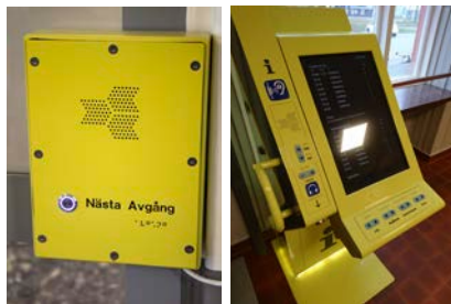
Fig. 1. Speaking machines that give spoken information on users' demand. The small device to the left and the large device to the right.

Observations were made during five hours at the central railway station in Gothenburg with the purpose to study passengers and visitors behaviour during different traffic announcements through the stations PA-system. Another purpose was to study the spoken information sources that the railway station provided, the so-called speaking machines as well as their placement and use. The speaking machines are boxes that give spoken information on the users' demand and exist as both small and large devices (Figure 1). Short questions were also asked to different travellers regarding the use and perception of the different sources of information.