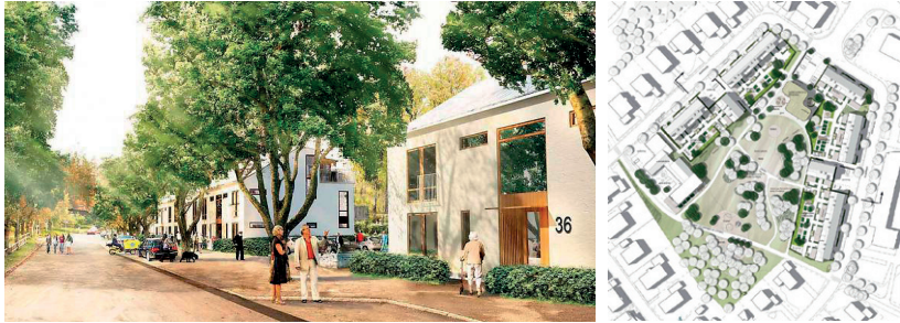
Figure 3. Winning design in competition at Gävle. Winner: Nyrén Arkitektkontor.

Applicants that fulfill the requirements will be evaluated according to the following criteria: