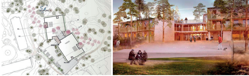
Figure 4. Winning design in competition at Linköping. Winner: Marge Arkitekter + Land Arkitektur.