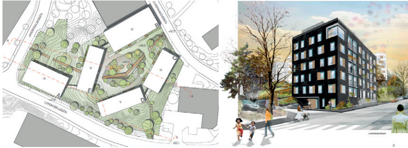
Figure 7. Winning design in competition at Nacka. Winner: Wallenstam + Semrén & Månsson

The company's application will be evaluated according to the following criteria: