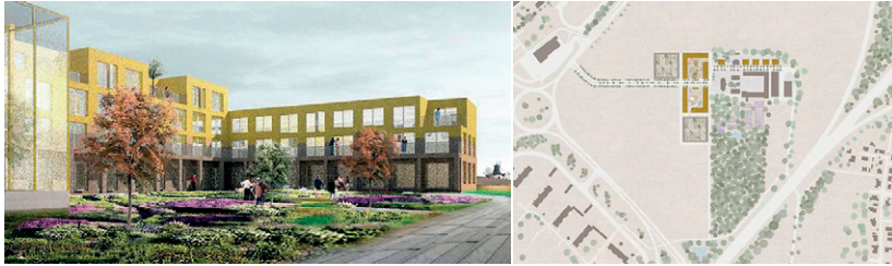
Figure 5. Winning design in competition at Burlöv. Winner: Johan Celsing Arkitektkontor.

persons in the committee represent the developer who also was the landowner. Three persons represent the municipality: the head of the welfare office and two representatives from the town planning office. The selection committee pointed out three architectural firms/teams to participate in the competition out of 51 applicants (Burlöv municipality 2011-12-06):