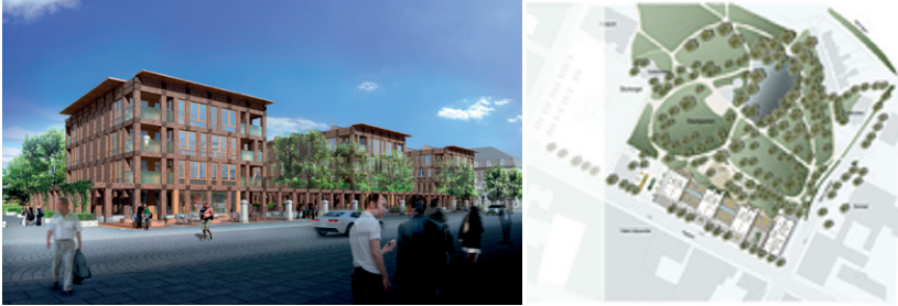
Figure 8. Winning design in the competition at Trelleborg. Winner: Riksbbyggen + Arkitektlaget Skåne.