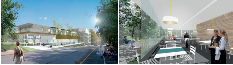
Figure 6. Winning design in competition at Danderyd. Winner: Strabag projektutveckling + Turako Fastighetsutveckling + Conara. Illustrations: Total Arkitektur och Urbanism.

to directly negotiate the purchase of the property. (Land allocation agreement, KS 2010/03 00).