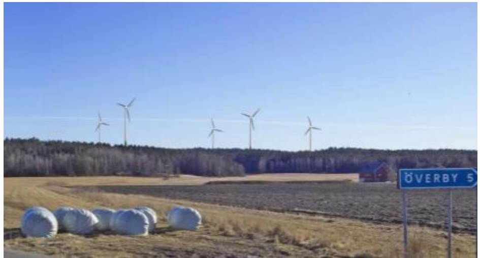
Figure 6. A photomontage over the five wind turbines planned at Lursång..

the possibilities of compensating the impact. The public and authority consultation and design of the individual wind farm runs parallel with the proceeding wind power plan. Therefore, the experiences of the consultations in the individual project merge into the larger process in which the municipality operates. Compensation measures for impact on cultural heritage were therefore later included in the adopted wind power plan.