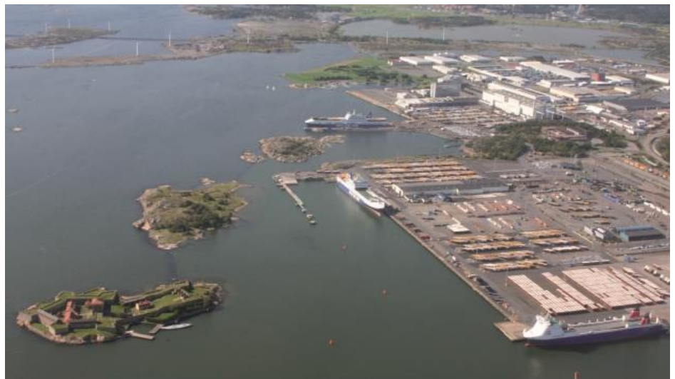
Figure 5. The Port of Gothenburg with the fortress Nya Älvsborg and the two islands of Stora and Lilla Aspholmen.

The workshop evaluating the case (Håkansson, 2015) showed us that even the detailed development plan is a vague instrument since the area had already been identified as a good spot for development. Maria Håkansson believes that the comprehensive plan is a much better tool to apply in order to avoid negative impact on cultural heritage. If the authorities at Linköping municipality had worked with compensation measures within its comprehensive plan, it would probably have led to a more transparent process. Instead, financial instruments control the process in Linköping. Through the voluntary agreement with the municipality, the developer is obliged to pay for the relocation of a building and renovation of another (Rönn, 2014a).