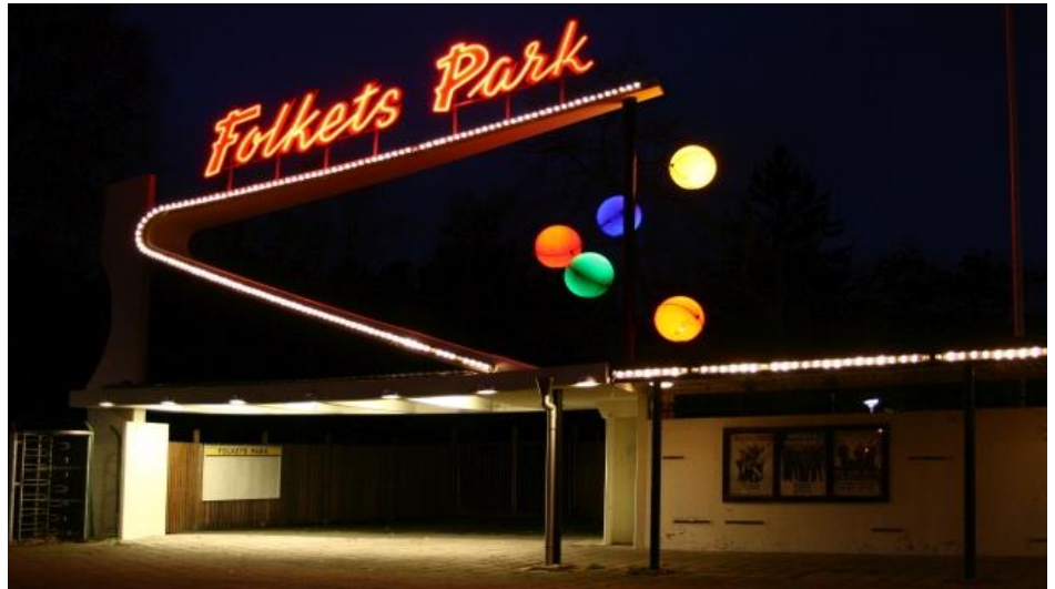
Figure 4. The entrance to the People' Park in Linköping at night

recreation space or amusement park (figure 4). In the beginning of the 21st century, the Folkets park had had its day as a place for entertainment for large parts of the society. But the setting still tells the visitor about the struggling labour movement, the developing democratic society and the modernistic 1900s.