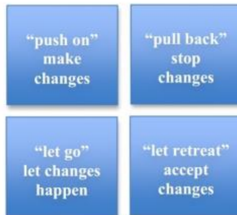
Figure 3. Strategies among stakeholders in community planning processes.

Depending on their role as key players in the community planning, the stakeholders will adopt different strategies along the way when dealing with matters concerning compensation. With inspiration from von Wright (1963), we can find four different strategies towards compensation among key players (Figure 3). They can push on and support the use of compensation in cultural heritage; pull back compensation proposals in planning processes; let the proposals become conditions for implementing construction projects; or retreat from this demand.