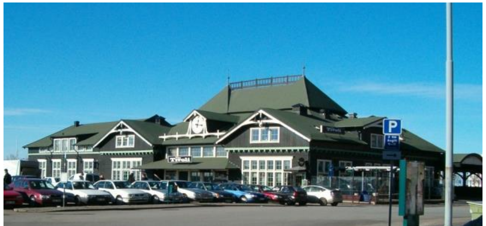
Figure 7. The Steam Ferry Station in Helsingborg. (Wikimedia Commons).

A large part of the discussion during the workshop was about whether a map with information, downloadable from the internet, could be seen as a compensation measure, and in that case how does it fit into our model (Figure 1)? Heritage managers have a special relation to conservation as well as authenticity , and it was very clear that the proponents for the heritage management point of view were not satisfied with the category different type of value on the same and/or different site . At the same time, those with a background in architecture had solutions in the early design of the wind farm. If the wind turbines were placed in another way, could this not be seen as compensation? The participants emphasized the importance of the municipality's wind power plan, but they also mentioned that the officials lacked professional knowledge about cultural heritage. This is a common occurrence. A majority of the Swedish municipalities lack staff with practical and theoretical understanding of current cultural heritage issues.