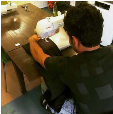
Figure 2. Introduction to sewing workshops promoted on Fixotek's Instagram account.