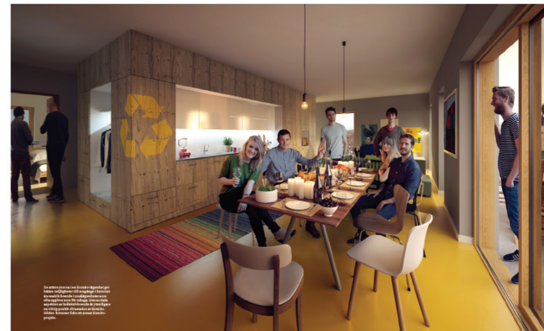
figure 15.7 Rendering of the living space within the Järntorget and Utopia Arkitekter, 2nd placed proposal

Through the competition, the organizer in Stockholm has gained access to information-rich documentation including the form of 15 configured proposals for new dwellings. All the proposals met the submission demands, none were rejected and, therefore, all can be assumed to have been presented well enough for the jury to select a first prize winner. One proposal has to be appointed as the winner, even when it is difficult to identify qualities and legitimise statements about architectural values. Any suggestion of arbitrariness can be minimised if the jury describes and presents clear reasons for the choice of winner, how the proposals have been valued and the qualities found in the winning proposal.