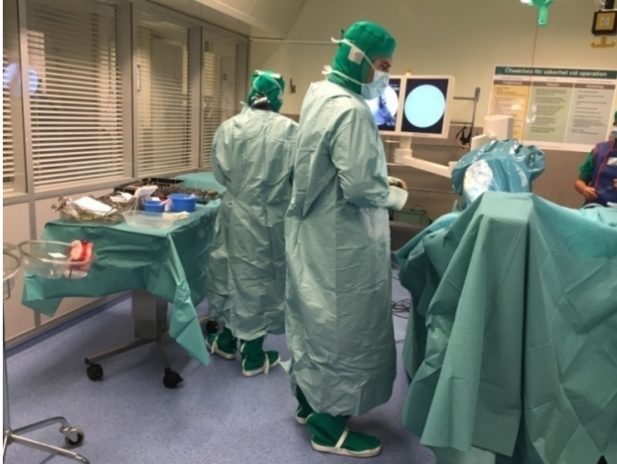
Figure 3. The surgical team dressed in the Olefin surgical clothing system with hood and knee-length boots.