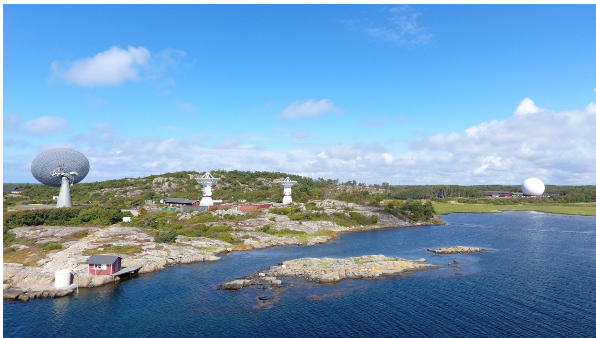
Fig. 3 The Onsala telescope cluster in 2016 with the new Onsala Twin Telescopes in the center of the photo. The new VGOS radio telescopes are equipped with reflectors of 13.2-m diameter. The radio telescope on the left hand side is the 25.6-m telescope installed in 1964, which is the first European telescope ever to be involved in VLBI. First geodetic VLBI measurements were performed already in 1968. The white radome on the right side of the picture houses the 20-m radio telescope installed in 1976, which was used with the Mark III geodetic VLBI system since 1979 and has the longest time series in the International VLBI Service for Geodesy and Astrometry (IVS) database. Close to the radome, but not visible in the photo, is the GNSS station ONSA, which was established already 1987 in the CIGNET network, several years before the International GNSS Service (IGS) was founded. ONSA had a pioneering role in the early days of GNSS, and has the longest continuous time series in the IGS network. There is also a gravimeter laboratory with a superconducting gravimeter. Shown in the picture foreground is the Onsala super tide gauge inaugurated in 2015. The observatory is one of the unique fundamental space geodetic sites that have a direct access to the sea level and co-locate VLBI, GNSS, gravimetry, and sea level monitoring. It is thus an important co-location site for the Global Geodetic Observing System (GGOS).