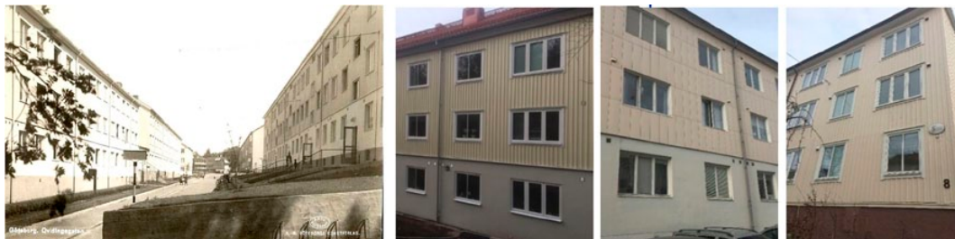
Figure 1a-d. Case A, a) In 1940s, block A1 (right in picture), block A2 (left), and block A3 (further in the right back), (photo from the web); b) Block A1 in 2017 after the re-renovation, c) Block A2 in 2017 with the panel boards put up in 1979, d) Block A3 in 2017. Photos b, c and d by the authors.

The façade on A3 differed originally from A1 and A2 (Figure 1d) and was never changed. In the latest renovation, the attic was insulated on the inside and all windows were replaced by the same as in block A1. The measured energy use decreased from 182 to 130 kWh/m 2 /year.