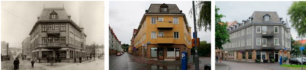
Figure 2. Case B, a) in 1890s, b) before the re-renovation, and c) in 2017.

Case B was originally built in the 1890s (Figure 2). In 1915, the block was extended with a few more apartments. In the 1970s, the upper floors were insulated and fitted with a new façade in orange corrugated metal. Around 2005, the block was bought by a developer that initiated a major renovation where the original apartments were altered and new apartments were created in the attic. The metal façade was removed, 50 mm of insulation was added and a new wooden façade was recreated. The outgoing side hinged windows were replaced by larger side hinged windows with a false mullion. The result was an energy use of 135 kWh/m 2 and year. No figures are available on the energy use prior the renovation. No changes were made to the courtyard façade which is still covered in metal sheets. The developer sold the block to the residents in 2011, who formed a housing association, but two of them wished to remain tenants.