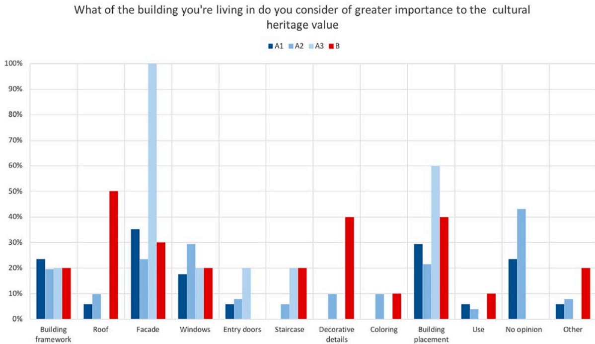
Figure 5. Appreciation of different external elements.