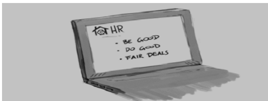
Fig. 1. Company values

Husmuttern is a new company with company value stated as: “Be good – do good - fair deals” (Fig 1). Husmuttern develops a temporary buildings production concept around two social challenges in Europe, namely the need of cheap