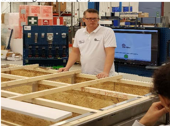
Fig. 3. Concept proofing test cell.

The necessary assembly sequence is balanced between the two operators and tried in supervised settings. Safety and quality critical issues are noted and poka-yoke problem solving is applied to make system fault proofed. The standard includes taking photographs to document all critical operations. Finally, the operation is currently being documented in standardised operation sheets. The solutions applied for assembly equipment can be categorised as quite low-tech, in order to make it easy and safe to operate. Poka-yoke implementation is similar to poka-yoke in regular construction work [29], mainly of the physical constraint type and not digitalised. All tools are battery operated electrical tools, no pressurised air is needed. Wood materials are pre-cut why no sawing and thus wood operations are fairly dust free, although some wood drilling does take place. Low dust insulation is chosen for the same reason. There is a high focus during concept proofing on finding any safety or quality risk and via redesign of equipment or parts assuring fault proof [30].