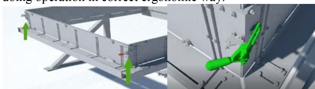
Fig. 4. Animation pictures (a) pointer; (b) tool

The Job-instruction, visualisation and quality assurance on the other hand can be categorised as high-tech. Instruction animations are shown on a large screen (see fig. 3) Digital animations of operations, for training and digital photographs for process assurance are used. Digital animations are used for visualising all operations. Since 3D drawings of all parts and equipment are available it is possible to animate all moves. In the current animations, there is no person in the movies. The tools are pointed out and colour coded as shown in Fig. 4 a and b. This is in line with recommendations in literature [31]. The animations are perceived as useful, and even critical, to have in the training and trial settings deployed. For ergonomic-critical moves it may be necessary to add mannequins in the animation showing how to hold/move properly. This is not yet implemented. The supervised training however emphasises on doing operation in correct ergonomic way.