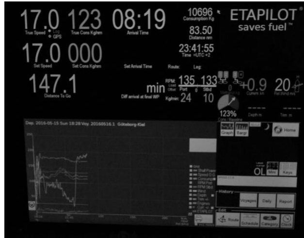
Fig. 1. The true speed (17 knots/hour) and the consumption (123 kg/nautical mile) is presented left top in the user interface of the ETA-pilot.

Although the ETA-pilot seemed to display a plethora of useful data, it was discovered that the tool failed to facilitate the crews' understanding of the impact of their actions on EE [8]. For example, the ship's crew considered it difficult to learn something out of the displayed numbers as nearly all the displayed information could hardly be integrated into the crews' practices for optimal EE performance. Rather, they relied heavily on those traditional navigational instruments and their own navigational experience to manoeuvre the ship, thus leaving the majority of the information provided by the tool un-used. Once a journey was finished, the tool would become useless for both the ship's crew and the management group onshore, though a considerable amount of data pertinent to ship performance had been collected, plotted and sent to the shipping company via the ETA-pilot. There were no evaluating activities. Learning based on reviewing historical EE performance was extremely difficult, but desired, for the ship's crew due to the lack of analytical function of the system [8].