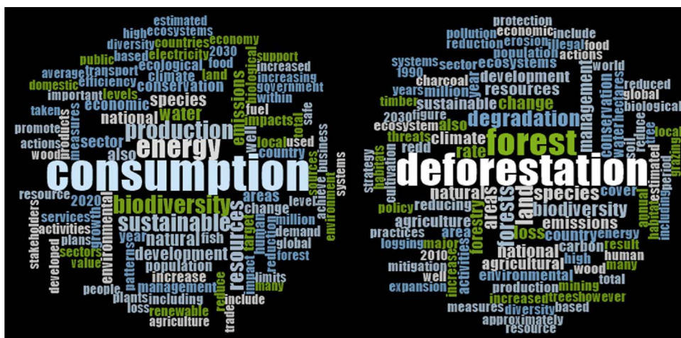
Fig. 2. Search terms consumption (2a) and deforestation (2b) and the most frequent terms found in the same paragraphs across all analysed documents. Word sizes are proportional to the frequency of used words.

agriculture, timber, logging, wood and charcoal, whereas terms such as commodities, export or trade are not contained.