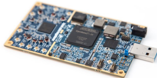
Figure 1: The LimeSDR front-end, which has been chosen for this project, is based on field programmable RF transceiver technology, combined with FPGA and microcontroller chipsets.

Although the USRP N210 front-ends used for the ground-based solution discussed in Section 2 were sufficient to demonstrate the feasibility of the GLONASS-R concept and operate the system in real-time, their size and weight does not make them the optimal choice for a SDR based GNSS-R solution that can be mounted on an airborne platform with payload weight restrictions. Thus, another front-end solution was sought for and found in crowdfunding project LimeSDR shown in Figure 1.