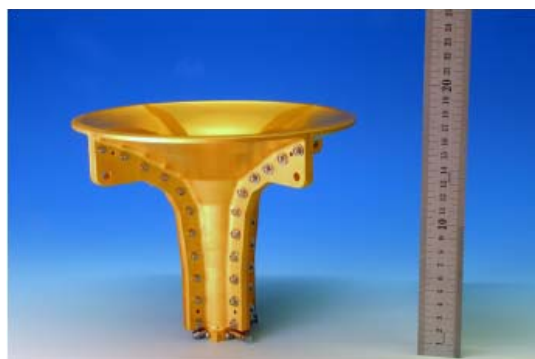
Fig. 2 Prototype of QRFH feed for SKA band B

The basic configuration of the Eleven feed is a pair of dipole over a ground plane. For UWB performance, a pair of the cascaded folded dipole array is employed for one polarization so there are two such pairs of arrays for dual polarization. Fig. 1 shows different versions of the Eleven feeds. The main advantages of the Eleven feed compared to the alternative UWB feeds are the nearly constant beamwidth and the fixed phase center location. Furthermore, the Eleven feed is one of the most compact decade-bandwidth feeds for reflectors.