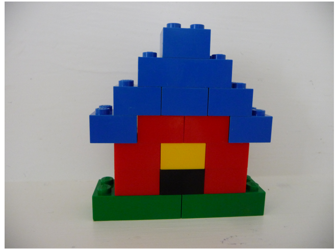
Figure 1: The final outcome of a correct LEGO house

In this study, we compare an HT and a humanoid RT instructing children to build a LEGO house as shown in Fig. 1. To our knowledge, a comparative study of a human versus a humanoid robot tutor with children in a classroom has not previously been investigated.