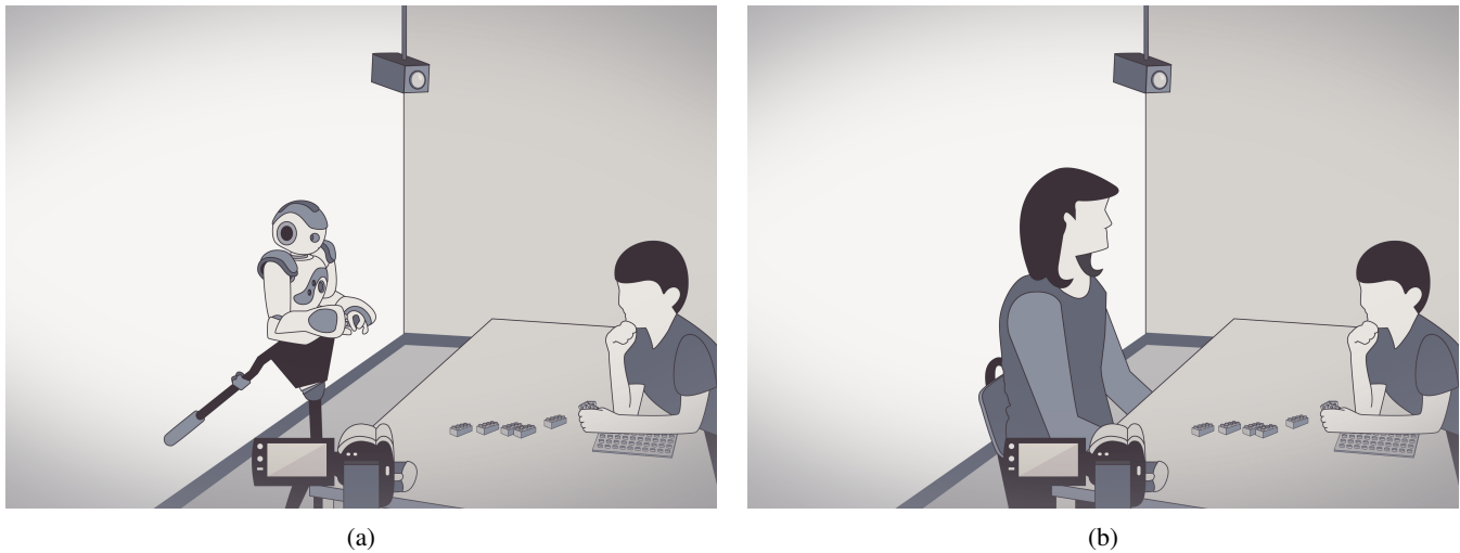
Figure 2: An illustration of the experimental setups with a human participant. Figure (a) illustrates the setup for a robot instructor, while figure (b) illustrates the setup for a human instructor

inter-actors is higher than with robot inter-actors [12][25]. Eye gaze is a central component of interaction, turn-taking and engagement in both verbal and non-verbal communication, and we anticipate higher levels of engagement with the HT, based on engagement patterns in conversation, often measured through eye gaze (direction, mutual gaze[8][25]).