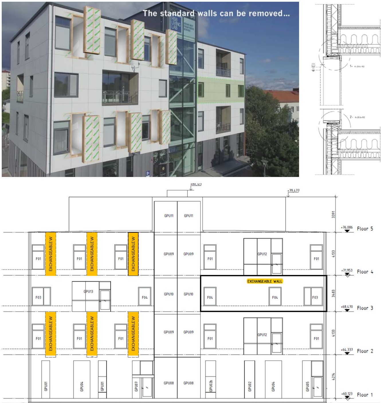
Figure 3. To the left: the position of six exchangeable walls of size 1.2x3.8 m on the west side of the building, on the second and the fourth floor. The light-green area on the third floor indicates another fully exchangeable exterior wall of size 12x3 m. Animation by Eyebright. To the right: a photo showing the exchangeable and the reference wall during the construction in a factory.

Thereby, it is estimated that HSB Living Lab has fulfilled the basic setup requirements as shown in Table 1. Since it has been in operation for a less than a year, it is too early to judge about the other two development phases, i.e. sustainability and scalability.