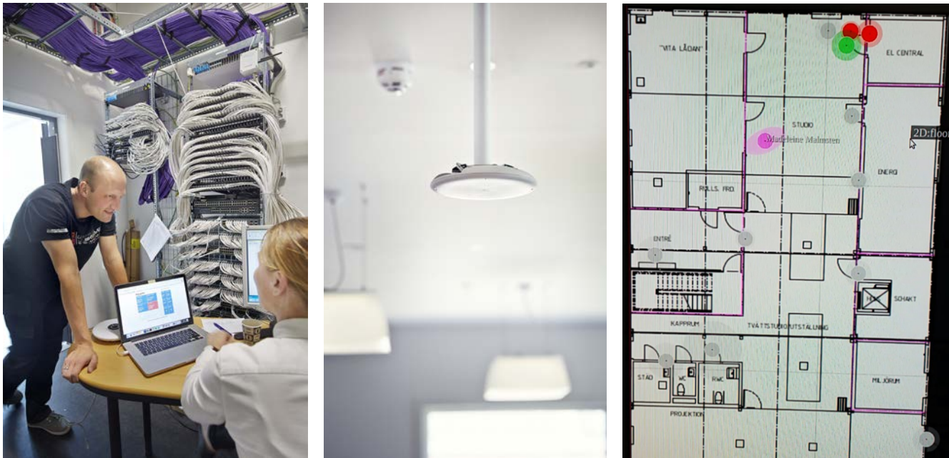
Figure 2. To the left and in the middle: Data centre inside HSB Living Lab and Quuppa tag tracking system. To the right: tag position data visualization at the entrance floor.

The so-called Home Energy Management project aims at improving the utilization and operation of building services in residential houses by: