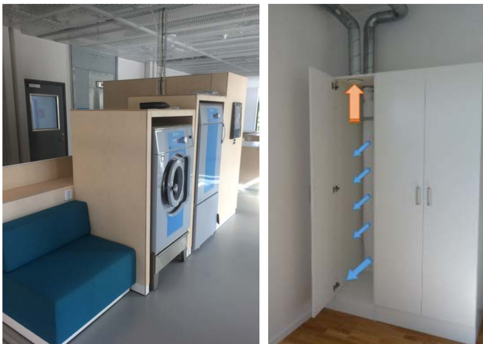
Figure 1. To the left: the multifunctional laundry placed as in the entrance hall of HSB Living Lab. To the right: the final design of the refreshment cabinet, installed in one of the apartments.

quality. Yet, many express doubts about feeling comfortable to wash 'in public'.